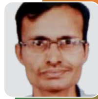
Shri Arun Agrawal

DDG (Satellite), Department of Telecommunications, Govt. of India