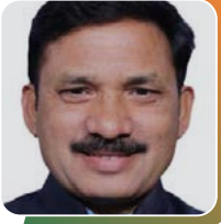
Shri Devusinh Chauhan

Minister of State for Communications, Department of Telecommunications, Govt. of India