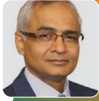
Dr. Neeraj Mittal

Minister of State for Communications, Department of Telecommunications, Govt. of India